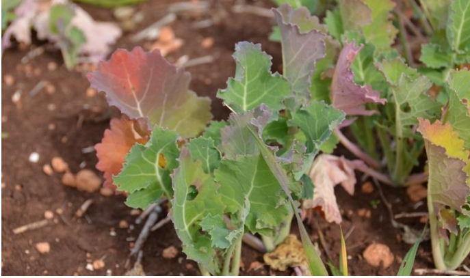
P deficient canola.