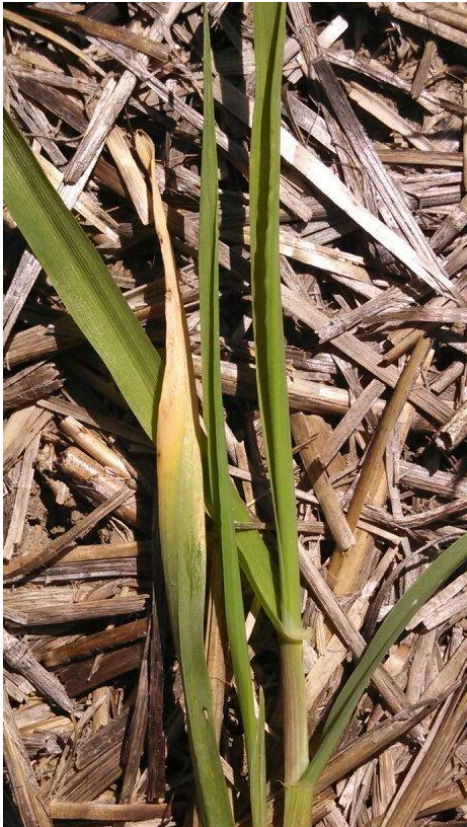
N deficient cereal from "drowning".