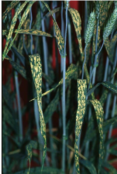
Cl deficient durum.