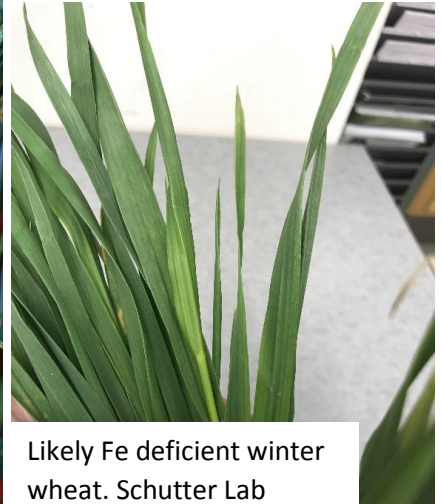
Likely Fe deficient winter wheat. Schutter Lab